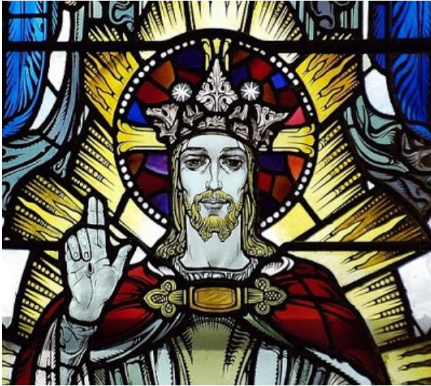
The Feast of Christ the King